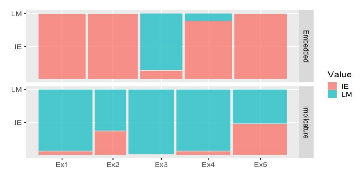
Figure 2: Relative proportion of responses per condition, by example

The A utterance in each case is a yes/no question. The B utterance is either a cl-comp sentence whose embedded content directly answers the question (Embedded Condition), or an atomic sentence from which an answer is inferable (Implicature Condition). The C utterance in each case is one of yes, that's right, I'm surprised or That's too bad . These responses are anaphoric, interpretable either as referring to the matrix content / literal meaning, or to the embedded content / implicature. (Each of the participants saw one version of each question+responses sequence, plus at least one filler, used to check for competence in the task.) A total of 20 responses was collected for each dialog in each condition.<sup>7</sup>