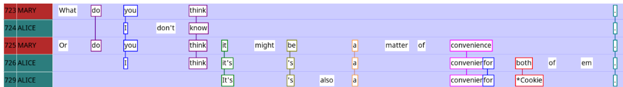
Figure 2: Rezonator representation of multilevel resonance, with structural parallelism of main clauses ( think : know ) and their clausal complements, where structurally aligned contrasts ( might be : it's ) frame the interlocutors' respective stances as relevant to collaborative epistemic problem-solving.

Figure 1 shows an annotation produced using Rezonator, which illustrates how even a brief excerpt may contain affinities at multiple levels of linguistic structure, including paradigmatic ( you : I ), inflectional ( being : 'm : 're ), antonymy ( smart : stupid ), argument structure, and clausal embedding, among others.