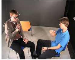
Figure 2: Follower's IndexingOtherToSelectOther