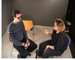
Figure 5: Follower's IndexingOthertoSelectSelf